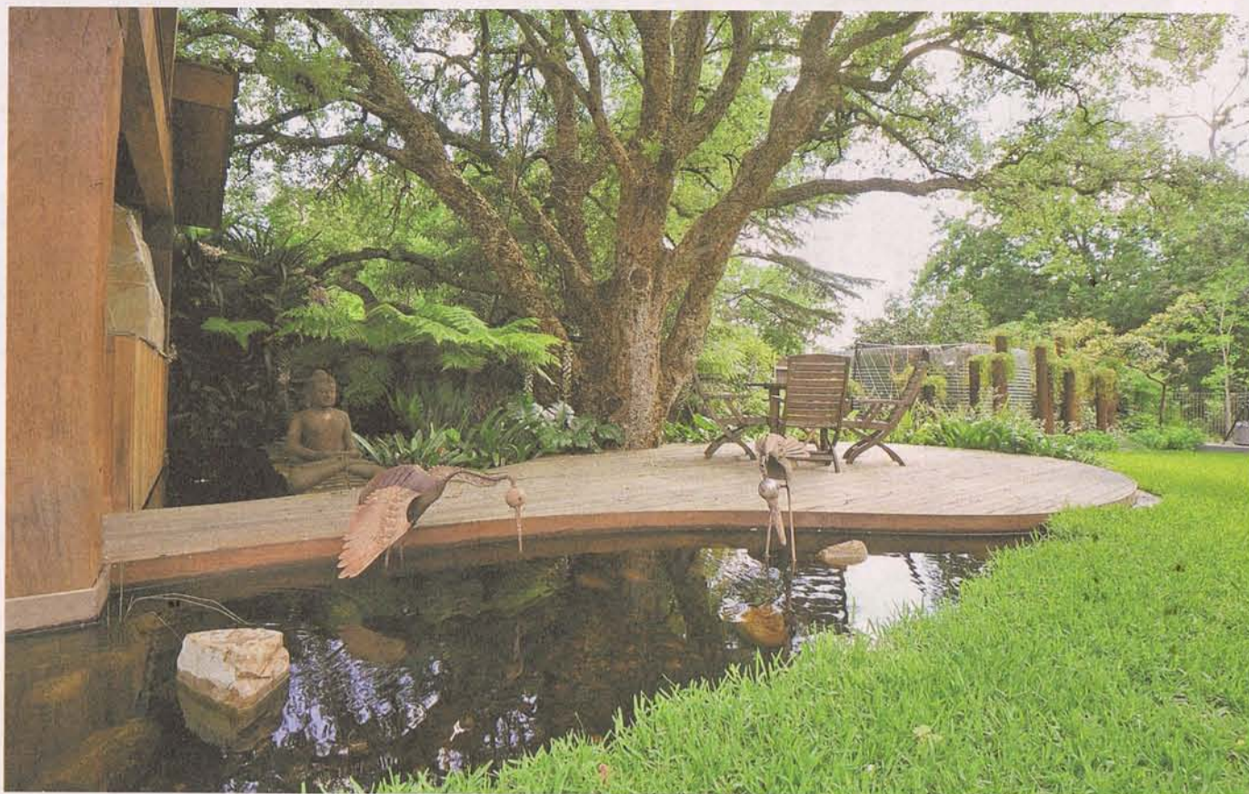
Left A magnificent cork tree is complemented by nearby decking and a pond Below Hydrangeas are among the pretty blooms that abound come summer Bottom Award-winning garden designer Richard Bellemo Bottom left The aquaponic wall

A n avid camper and lover of the great outdoors, garden designer Richard Bellemo believes firmly in the bush-camping credo of 'leave no trace'.